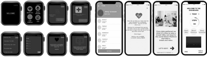
Figure 2. Prototype Screens- Following the architecture.